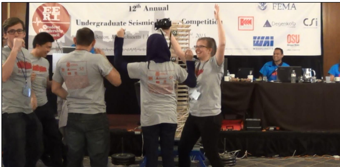
Team celebrating their structure's survival of the third and final ground motion